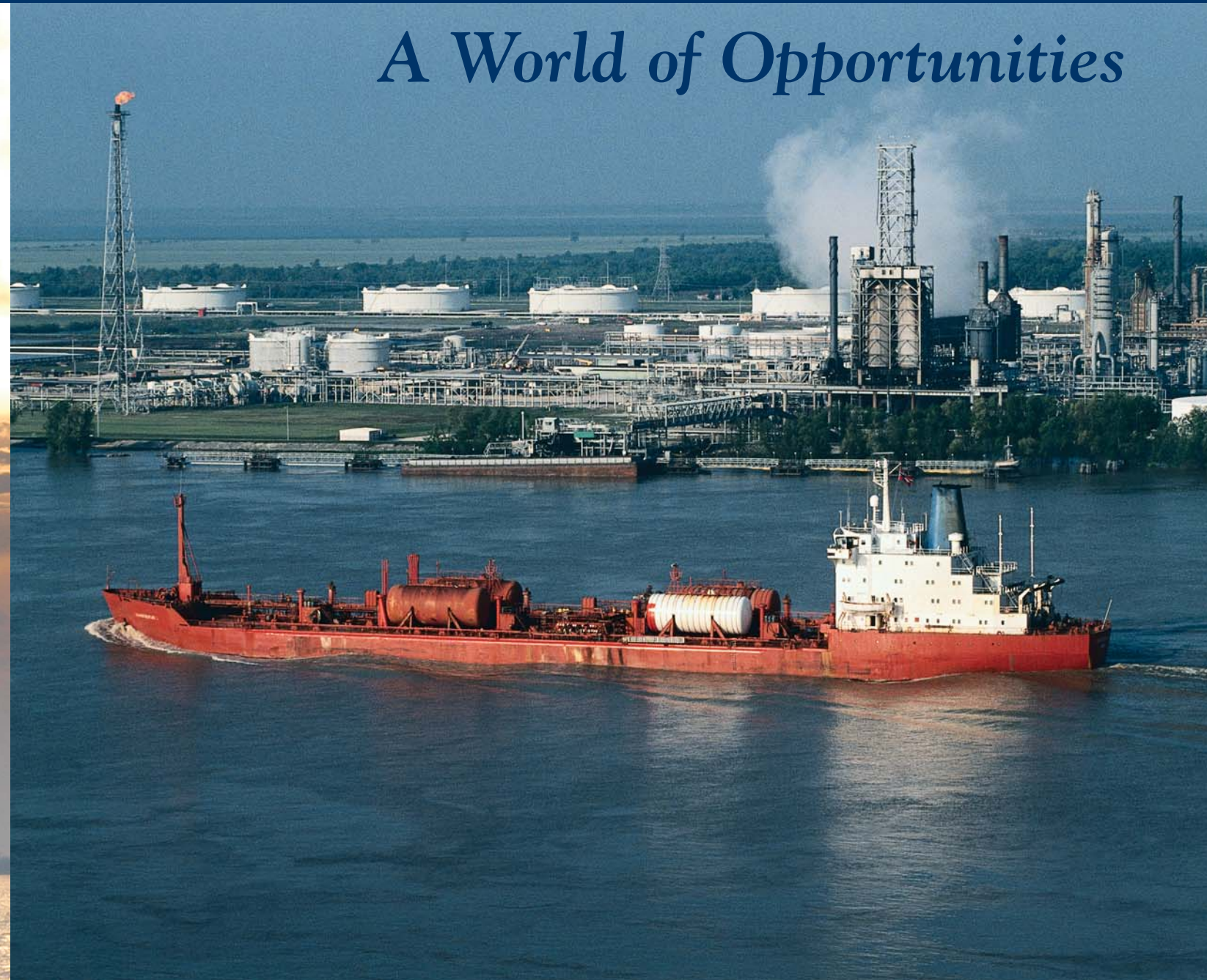
A special thanks to the Crescent River Port Pilots, especially Capt. Billy Crawford, Capt. Charles Rowbatham, and Capt. David Main for providing some of the photographs used in this brochure.

Plaquemines Port, Harbor and Terminal District 9063 Highway 23, Belle Chasse, LA 70040-1804 USA Direct Line: 504-682-7920 Fax: 504-682-0649 24 Hour Line: 504-297-5660 www.plaqueminesport.com